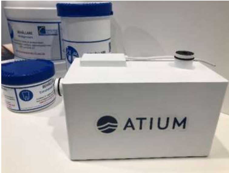
Prototype of new technology supporting amalgam separator, with electrochemical filters.